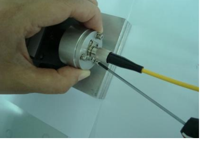
Figure 4-Checking laser output power