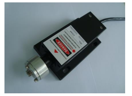
Figure 2-A CNI 532nm laser module with optical fiber coupler attached