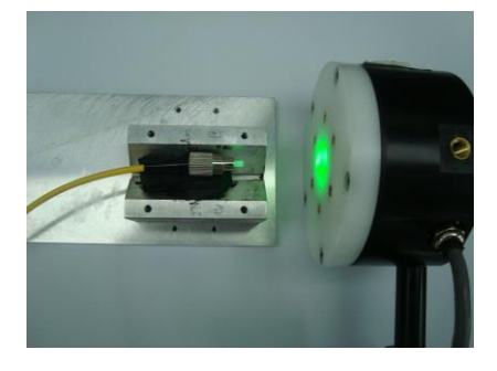
Figure 5-Alignment completed