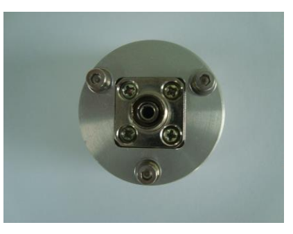
Figure 1-An optical fiber coupler

Optical Fiber couplers are optical components that are designed to allow a free - space laser beam to efficiently enter an optical fiber. Their design is simple: A focusing optic is used to reduce the beam to as small a waist as possible, and the input aperture of the optical fiber is attached at the focal point so that the largest amount of optical power possible is sent into the fiber. While there are many different kinds of fibers and fiber couplers, this guide will focus on couplers and fibers available from ULTRALASERS. The three basic elements of a fiber coupler are the coupler body that attaches to the aperture of the laser module, the focusing optics located inside the fiber coupler body, and the fiber port platen held in place by three hex cap screws on coupler. The fiber port is integrated into the fiber port platen and is not designed to be removed.